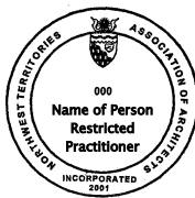
RESTRICTED PRACTITIONER'S STAMP